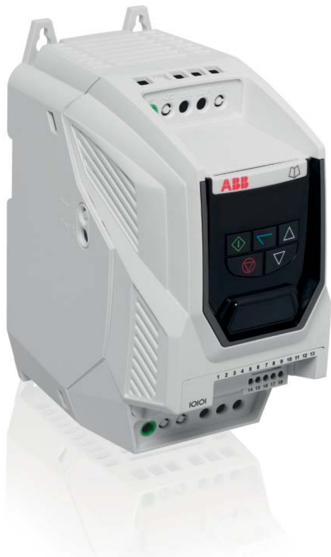
ABB micro drive ACS250 with 600 V AC supply offers easy to use and compact solutions for general purpose low power applications, such as; screws, mixers, pumps, fans and conveyors. The key features include a built-in safe torque-off (STO), Modbus RTU and CANopen communication interfaces.